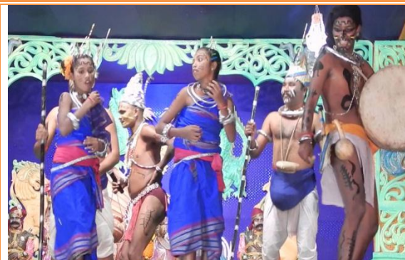
(d) Folk dance in Raj durbar before King Kansa