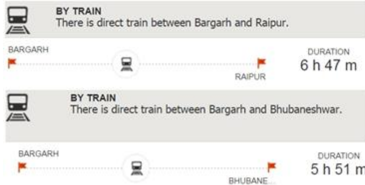
Figure 3 shows the train route map of Bargarh from two Capitals from Raipur and Bhubaneswar

The study of open air roving drama Dhanuyatra of Bargarh in the state of Odisha within the framework of festival tourism requires to presents the complete profile of the festival. The devotees of Lord Krishna started the first “Divya Mahotsava Dhanuyatra” in 1870 Shakabda Pousa Sukla Pratipada Sombar (Monday) dated 12.01.1948 at 12:00 noon and ends on Pousa Purnami Sombar (Monday) dated 26.01.1948 at 9:00 am as per the official website. It is said by some old people that as a way to celebrate the freedom, of newly formed independent India after the British rulers, the labor class workers started this festival. Death of Kansa symbolised the end of colonial rules .So there is different opinion regarding nature of evolution of the festival. But the date of commencement of festival and date of completion is decided as per the Hindu calendar that is Pausa Sukla Panchami to Pausa Purnima mostly during December - January. The yatra lasts for a period of seven to eleven days. There are no written scripts for this act which depicts its uniqueness among rest other plays.