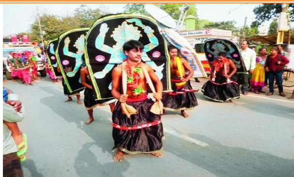
(c) Artists are in rhythm during Nagar Bhraman