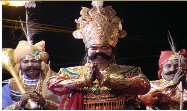
(a) King Kansa at Worshipping Attire to God.

tradition. It is considered to be a strong contributor to the festival, which also support and build on the city image, contribute to sustainable economic, social and regional development, create employment for artists and encourage the celebration of cultural diversity. It contributes significantly to the cultural and economic development of the locality.