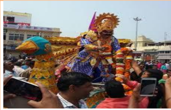
(b) Nagar Parikrama by King Kansa on his Chariot